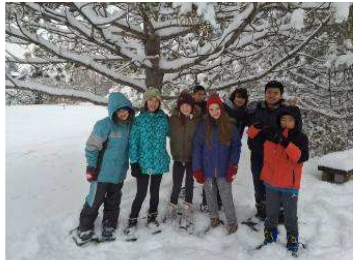
Students snowshoeing behind the school

The next newsletter will be published on Friday, February 10, 2017