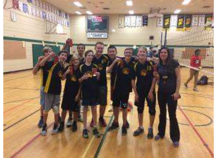
The boys intermediate volleyball team